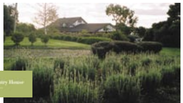
Readers' Retreat & Country House

For a 10% discount, book and quote this page number 54 in gr magazine before 30th June 2007.